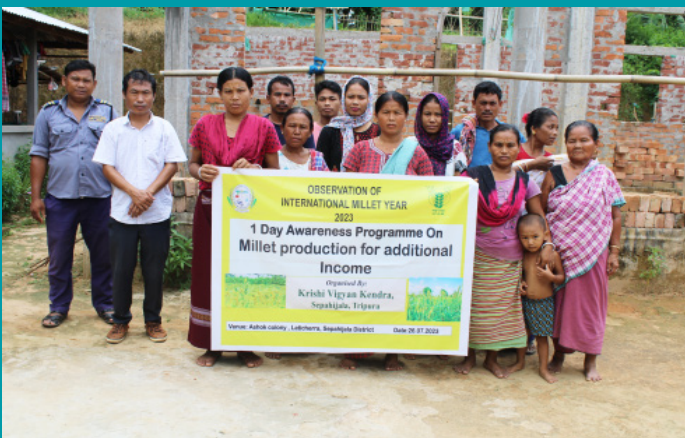
Awareness programme on Millet Production

KVK, Sepahijhala, Tripura hosted an awareness program on Millet production for additional farm income on 26 July, 2023, at Latiacherra, for celebration of the International Year of Millets. The programme emphasized the significance of millets for nutritional benefits to human being, food security, market demand, and the variety of value-added products that can be developed from millets.