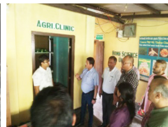
Visit to Agri Clinic by ATARI Team