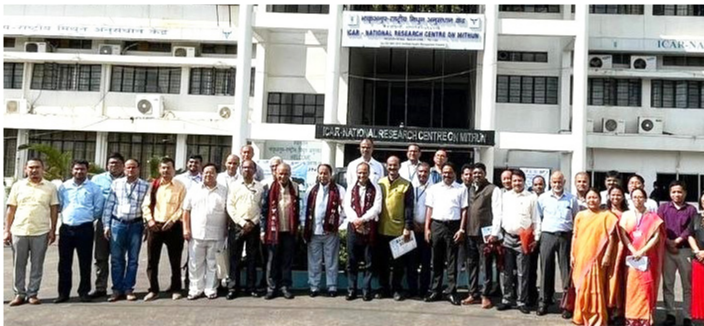
Participants of AZW,2023 at NRC Mithun