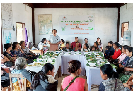
Millet Recipe Contest conducted by KVK Lawngtlai at Vaseikai Village