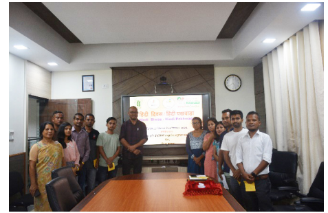
Staff of ICAR-ATARI Umiam participating in Hindi Pakhwada