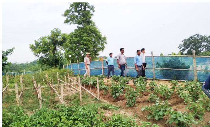
Visit of DM Unakoti to Natural Farming demo unit of KVK Unakoti

The DM expressed satisfaction over the KVK's activities and lauded the efforts of KVK, particularly for natural farming demonstration. He suggested that KVK should emphasize on Integrated Farming Systems (IFS) at farmers' fields, production of planting materials, and value addition of mushrooms.