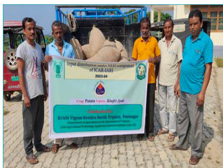
Input Distribution of HYV Potato seeds by KVK North Tripura