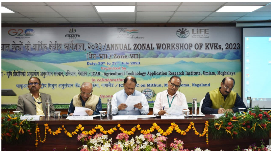
Inaugural Function of AZW of ICAR-ATARI, Umiam