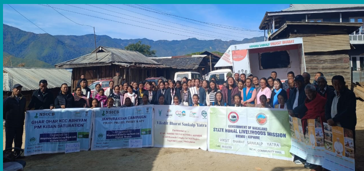
Awareness program on Natural Farming and Soil Health Card under VBSY

KVK, Kiphire, Nagaland actively participated in the Viksit Bharat Sankalp Yatra (VBSY) programme since its launching from Kiphire village. Capitalizing on the gathering of numerous farmers and rural residents, KVK Kiphire raised awareness about the benefits and importance of Natural Farming and the Soil Health Card. During the VBSY program, farmers were educated on the principles and practices of Natural Farming, particularly in input-scarce areas like Kiphire. They were also encouraged to have their soil tested through KVK Kiphire to receive tailored recommendations via the Soil Health Card. With the presence of scientists, district line department heads, BDO, ADC, and SDO (Civil), farmers responded positively to the awareness campaigns, eagerly registering for upcoming training and demonstration programs. A total of 1,256 farmers registered across 14 campaigns held during the VBSY period.