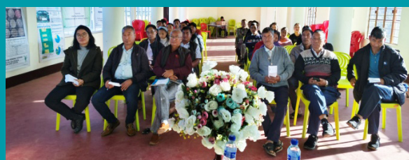
Participation of farmer in Awareness programme