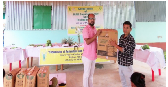
95 th ICAR Foundation Day celebration at KVK, West Tripura