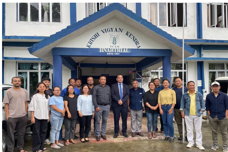
Visit by Secretary, Department of Agriculture, Government of Mizoram