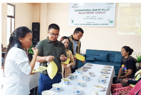
Millet Recipe Contest conducted by KVK Lawngtlai at Chawnhu Village

In order to promote awareness on the importance of millets and their nutritional values Krishi Vigyan Kendra Lawngtlai, Mizoram organized Millet Recipe Contests in three blocks of Lawngtlai district namely Lawngtlai , Chawngte and Bungtlang South block. Many recipes of indigenous millets such as Bajra, Jowar, and Ragi were prepared by women self-help groups and showcased during the contest. During these contests, the importance and nutritional properties of millets were highlighted by showcasing various millet-based products to the public. This initiative generated interest among consumers in millet-based preparations.