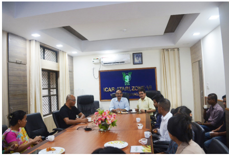
Director, ICAR-ATARI Umiam addresses the staff during the inaugural function of Hindi Pakhwada