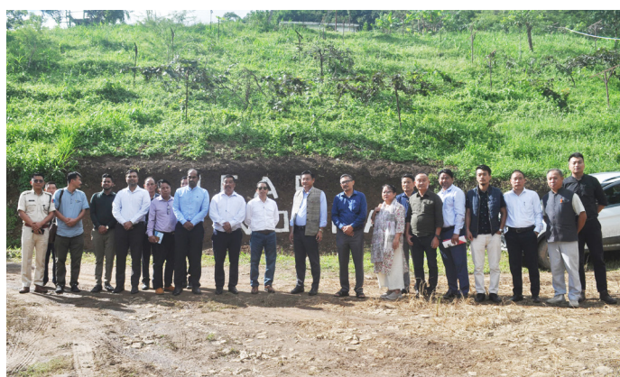
Delegates during DPDB meeting at ICAR-KVK, Wokha Campus