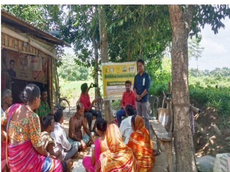
Training programme on integrated management on Parthenium at Golaghati GP