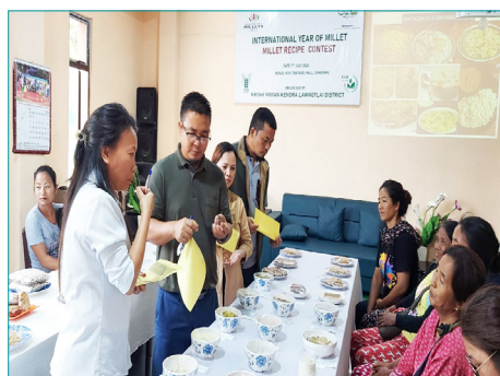
Millet recipe contest by KVK Lawngtlai