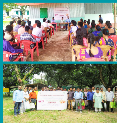
Training programme on 'Onion cultivation' at KVK, West Tripura