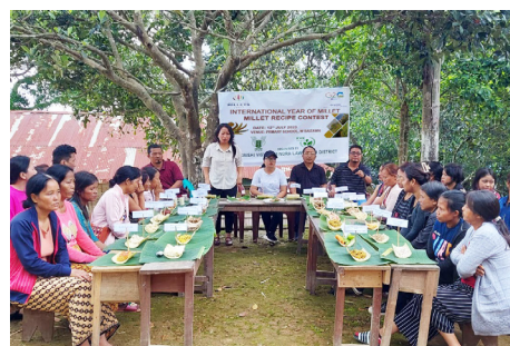
Millet Recipe Contest conducted by KVK Lawngtlai at West Saizawh Village