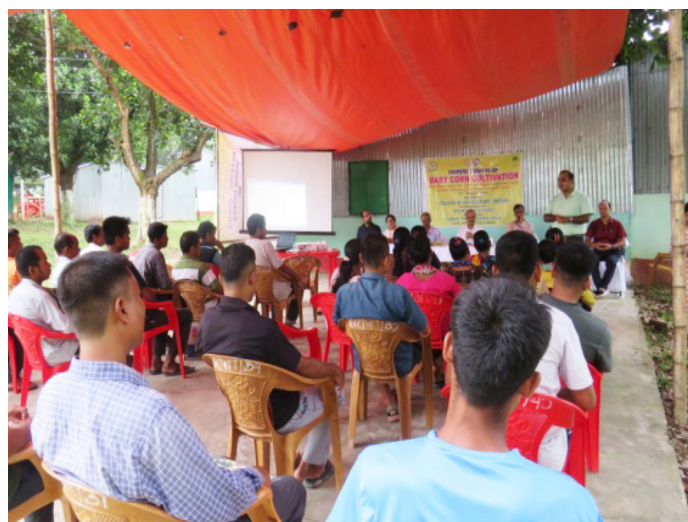
Training programme conducted on Baby corn cultivation at KVK West Tripura