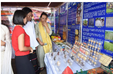
Interaction with the Chief Guest during visit to stall