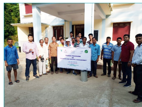
Training Program on Beekeeping by KVK Gomati