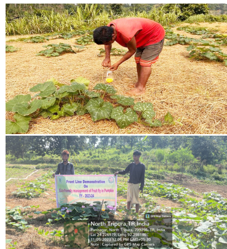
Installation of Fruit Fly Traps by Farmer at Damcherra

Krishi Vigyan Kendra, North Tripura conducted a training cum demonstration programme on "Pheromone Traps for the management of fruit flies" on 11 September, 2023 at Damcherra under the Front Line Demonstration (FLD) programme titled "Eco-Friendly Management of Fruit Fly in Pumpkin." The demonstration highlighted the importance of fruit fly traps, which attract and capture adult fruit flies before they can lay eggs in crops. This method helped to monitor and reduce crop damage while controlling the fruit fly population. In fact, pheromone traps may be an effective and non-toxic solution for managing fruit fly infestations in pumpkins.