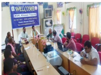
Interaction with staffs of KVK, Khowai

Thereafter, various official records, documents, registers were verified and suggestions were given for further improvement of the functioning pattern of the KVK. The team along with staffs of KVK also visited various demonstration units viz., poultry units, IFS units, crop demonstration plots, mushroom spawn production laboratory, Agri-Clinic etc along with the infrastructure created by KVK. The team expressed satisfaction over effective utilization of KVKs' revolving funds for different income generation activities.