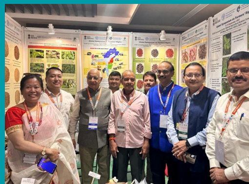
Director, ICAR-ATARI Umiam along with team participating in the Global Symposium at NASC, New Delhi