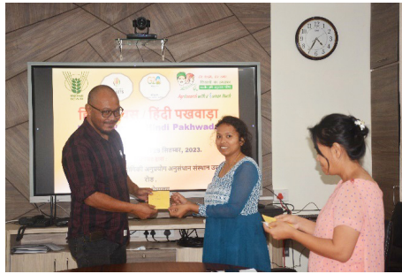
Prize distribution during Hindi Pakhwada