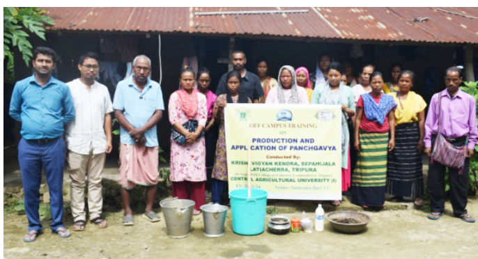
Demonstration on preparation of panchgavya