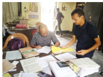
Inspection of documents related to finance