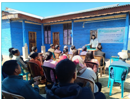
Janajatiya Gaurav Divas by KVK Kiphire