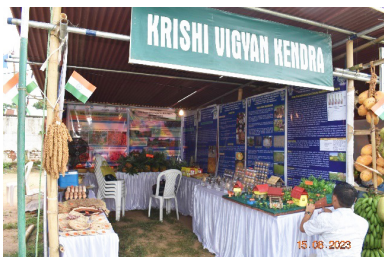
Technology showcasing by KVK, Dimapur