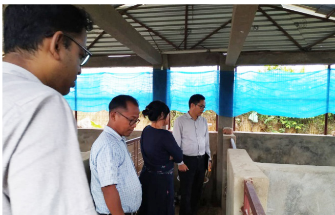
DM Unakoti visits Piggery unit of KVK Unakoti