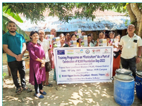
Training Program on floriculture by KVK Khowai