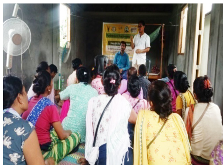
Cleanliness drive, on Parthenium on at Sangkuma VC.