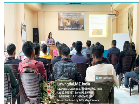
Training on Soil Health Card by KVK Lawngtlai