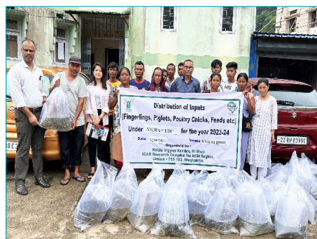
Distribution of fingerlings by KVK Ribhoi