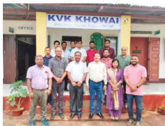
ICAR-ATARI, Umiam Team with KVK, Khowai staff