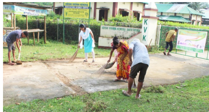
Cleaning of KVK South Tripura Premises on the occasion of Swachta Campaign