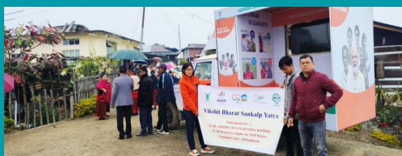
VBSY launched at Kiphire

KVK, Kiphire, Nagaland actively participated in the Viksit Bharat Sankalp Yatra (VBSY) programme since its launching from Kiphire village. Capitalizing on the gathering of numerous farmers and rural residents, KVK Kiphire raised awareness about the benefits and importance of Natural Farming and the Soil Health Card. During the VBSY program, farmers were educated on the principles and practices of Natural Farming, particularly in input-scarce areas like Kiphire. They were also encouraged to have their soil tested through KVK Kiphire to receive tailored recommendations via the Soil Health Card. With the presence of scientists, district line department heads, BDO, ADC, and SDO (Civil), farmers responded positively to the awareness campaigns, eagerly registering for upcoming training and demonstration programs. A total of 1,256 farmers registered across 14 campaigns held during the VBSY period.