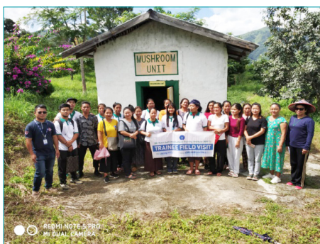
Farmer Visit at KVK Churachandpur