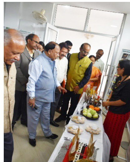
Delegates visiting exhibition Stall

ICAR-Agriculture Technology Application Research Institute (ATARI), Zone VII, Umiam, Meghalaya organized Annual Zonal Workshop of KVKs for the year 2023 at Nagaland in collaboration with ICAR-National Research Centre on Mithun, Medziphema from 20- 22 July 2023. The workshop was organized with a theme “Translating Research to Development for Sustainable Agriculture in North East region” which envisaged in fostering collaborations and partnerships among various allied organizations, providing ample opportunities for the KVK scientists to learn about the appropriate and latest technological options for large scale technology applications in the field and also reviewing the significant accomplishments of Krishi Vigyan Kendras under ICAR-ATARI, Zone VII.