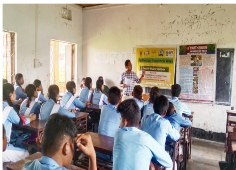
Awareness programme on Parthenium at Latiacherra High School.