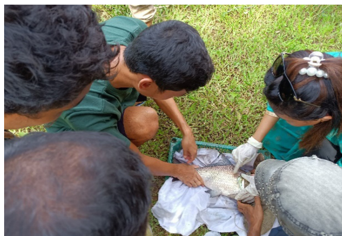
Demonstration of Induce breeding technology in farmer's field