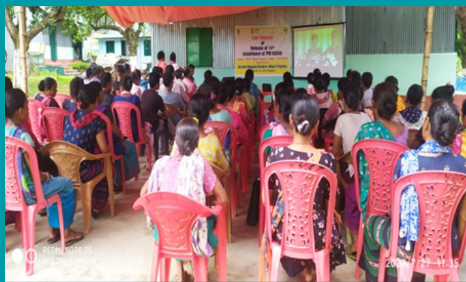
Live streaming of PM KISAN programme at KVK, West Tripura