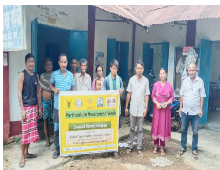
Awareness programme on Utilization of parthenium for compost making on 17 August, 2023 at Rangmala VC.

KVK, Sepahijhala observed a Parthenium Awareness Week from 16 - 22, August, 2023 in various locations across the Sepahijhala district. The program aimed to educate farmers, farm women, and students about the menace of Parthenium hysterophorus , an invasive and aggressive weed species and its management strategies. During the week-long awareness programme, a total of 135 participants were sensitized about the negative & positive impacts of Parthenium. Despite its harmful effects on agriculture, human health, and livestock, the weed can be utilized as a nutrient-rich fertilizer, herbicide, insecticide, and phytoremediation. However, it is considered as one of the world's worst invasive weed species that can cause a range of health issues like skin rashes, diarrhoea and respiratory problems and also reduces agricultural production leading to biodiversity loss, which requires a multi-pronged approach, including mechanical, chemical, cultural, and biological control methods, for effective management.